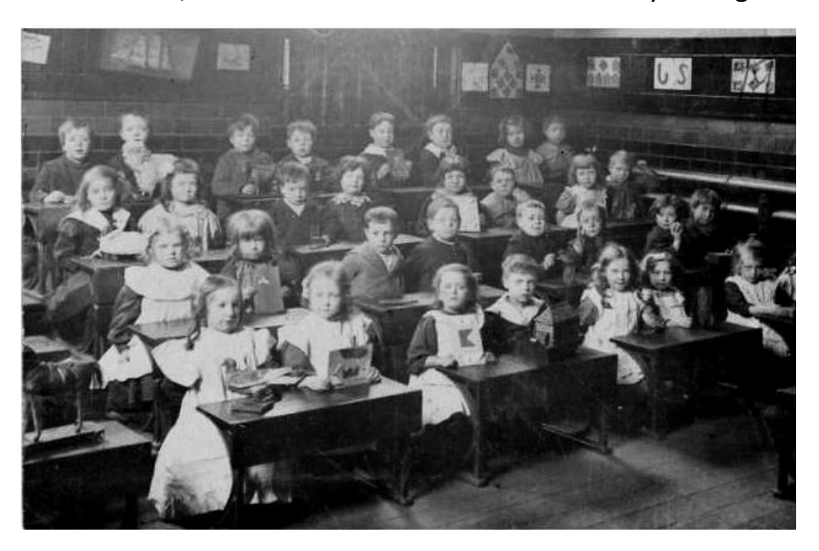
Picture 4 - A classroom in Holmes Chapel School. Note the type of desks, and the posters on the walls

At the front would be a big wooden blackboard on a stand, on which the teacher wrote using chalk. The teacher's desk was often raised on a platform and teachers sat on tall chairs so they could watch the children at their desks. Near to the teacher's desk would be an iron stove, with a coal fire during the winter. The fires were often small, and in winter, children at the back shivered their way through classes.