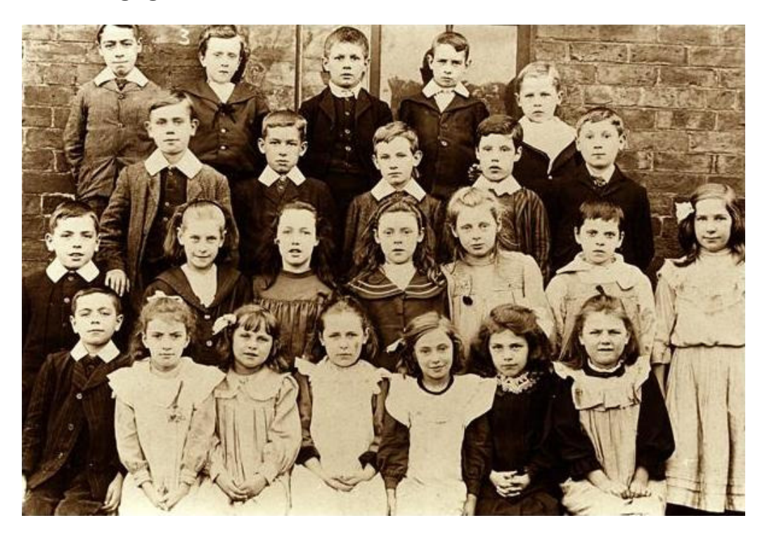
Picture 5 - Group in front of Cranage School - taken before the First World War

During the War, several teachers had to perform different roles, for example: in September 1916 the Head teacher of Holmes Chapel School recorded "To avoid the disorganisation that would have arisen through a member of the staff attending as nurse on an Official day at the Somerford Hospital, and the absence of children, an emergency half holiday was granted." Also, "27<sup>th</sup> March 1918 – The School closed for the Easter vacation. But the following day, Thursday, the Teachers were engaged elsewhere to write out Meat Ration cards."