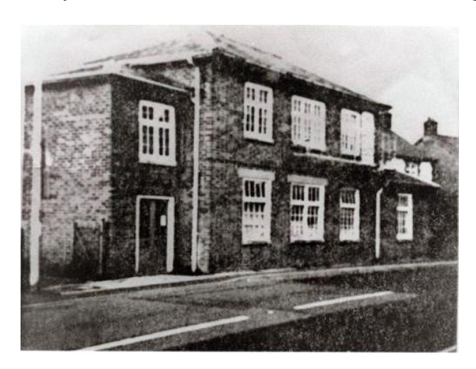
Holmes Chapel School. St Margaret Ward Catholic Church was